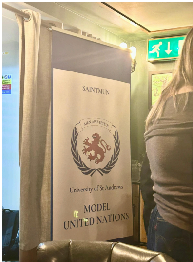
A poster for University of St. Andrews Model UN.

The first event I attended was a Pub Quiz (highly common in St Andrews) in a collaboration between UNA St Andrews and the Model UN societies. Societies are like university clubs in the U.S., you can join them as a general member and even run to be part of their committees. The location, The Saint hotel and restaurant in St Andrews, provided a cozy and welcoming environment for attendees. Participants could order drinks and then make their way down into "the bunker" in preparation for the quiz. Each question presented offered a new angle and entertaining subject on world politics: who is the current First Minister of Scotland? What global leader was pictured on vacation while shirtless? And when was the Universal Declaration of Human Rights (UDHR) adopted? (How many questions could you readers answer confidently?) Each question you answered correctly on your paper was a "point" for your team, where papers were then exchanged and graded by different teams at the end of each round. St Andrews is an extremely multiethnic, culturally and socially diverse university, and this was certainly manifested in the different undergrads and postgrads who showed face at the quiz.